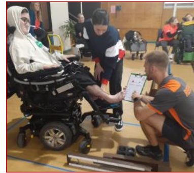
Signing the score sheet at the conclusion of the final.

The Boccia Australia National Titles 2021 are to be held in Hobart from 15 to 18 November. Complex planning has commenced with the travel company Viva Travel. This company has established a branch — Supported Travel eXperiences — to assist people with disabilities to travel .